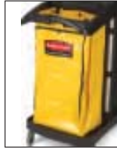
9T80 High Capacity Vinyl Bag