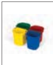
9T83 5 Quart Disinfecting Pails

Dim 7½" l x 9½" w x 8½" h Ship Wt 6 lbs Color BLUE, GRN, RED, YEL Pack 4 (1 ea color)