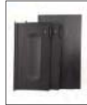
9T85 Locking Cabinet Door Kit

Dim 9½" l x 17" w x 19" h Ship Wt 8 lbs Color BLA Pack 1