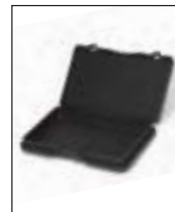
6179 Waste Cover & Storage Compartment

Dim 28" l x 19½" w x 1½" h Ship Wt 7.3 lbs Color BLA Pack 6