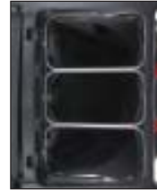
9T89 Triple Waste Wire Bag Holders