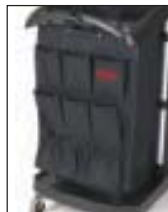
9T90 9-Pocket Fabric Organizer

Dim 28" l x 19½" w x 1½" h Ship Wt 7.3 lbs Color BLA Pack 6