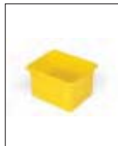
9T84 30 Quart Storage Bin

Dim 7½" l x 9½" w x 8½" h Ship Wt 6 lbs Color BLUE, GRN, RED, YEL Pack 4 (1 ea color)