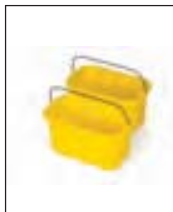
9T82 10 Quart Disinfecting Caddy

Dim 7½" l x 14" w x 8" h Ship Wt 10 lbs Color YEL, BLA Pack 6