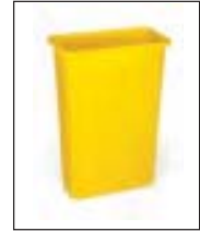
3540 Slim Jim® Waste Container

Dim 33" l x 10½" w x 17½" h Ship Wt 6.2 lbs Color YEL Pack 2