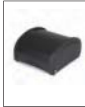
9T86 Locking Security Hood