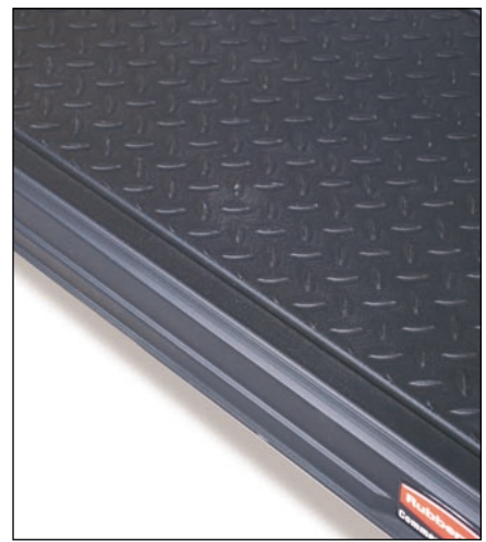
Molded-in diamond plate deck to reduce load slippage.