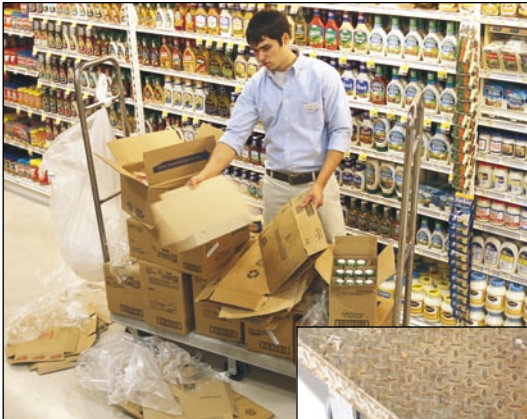
Traditional metal "u-boats."