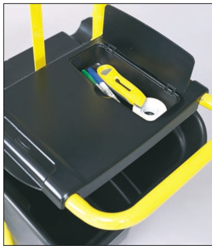
Convenient tool storage area on work surface.