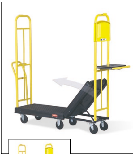
Folding ES version for smaller jobs and convenient storage.