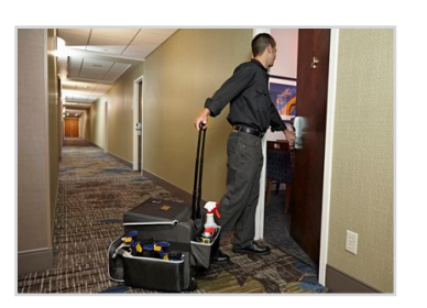
Versatility Versatile compartments allow for multiple configurations and uses, including housekeeping, maintenance, and more.