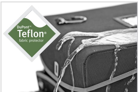
Repels Water, Oil, and Stains Teflon® fabric protector helps maintain Quick Cart aesthetics and protects from rigorous daily use.