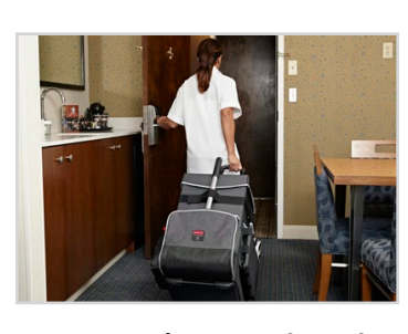
Compact and Ergonomic Design Lightweight and more compact than traditional carts for easier maneuverability in tight spaces.