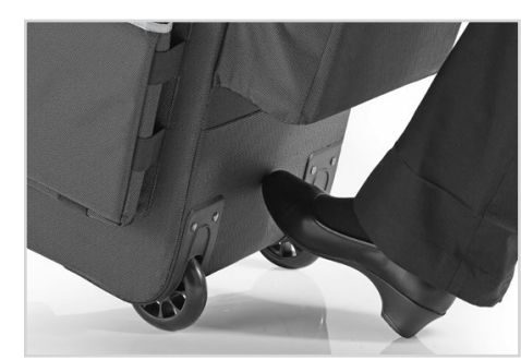
Heavy-Duty Kick Plate Reinforced rubberized kick plate for increased durability and reduced wear and tear.